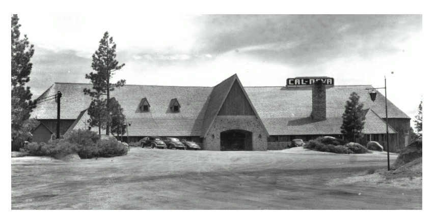
Newly finished lodge – 1937 (note close resemblance to earlier sketch)

Once completed, the new Lodge was more than twice as large as the original (casino plus dance hall) and spanned almost 220 feet from end to end. It was nearly 100 feet from front to back giving it nearly 20,000 feet of livable space under the roof. It featured "a 70-foot oval bar and 70-foot circular bar, dance and dining salon and observation platform." It even had its own 'heating plant' (furnace) installed for potential year-round operation. But more importantly, it now claimed to be "the largest legalized gaming casino of its type in the United States."